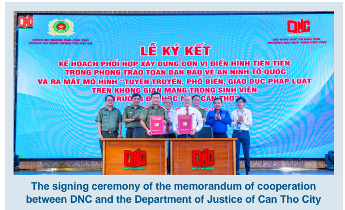
The signing ceremony of the memorandum of cooperation between DNC and the Department of Justice of Can Tho City