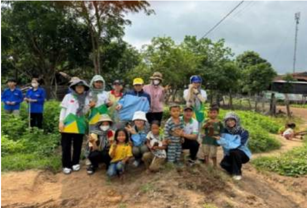
Students from DNC participated in charity activities with children

One of the most meaningful annual activities at DNC is the organization of community events and volunteer programs to support disadvantaged groups in society.