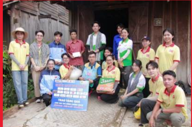
Students from DNC gave gifts to disadvantaged people

The faculty and staff of DNC actively participated in volunteer work alongside former and current students, promoting positive values within the community.