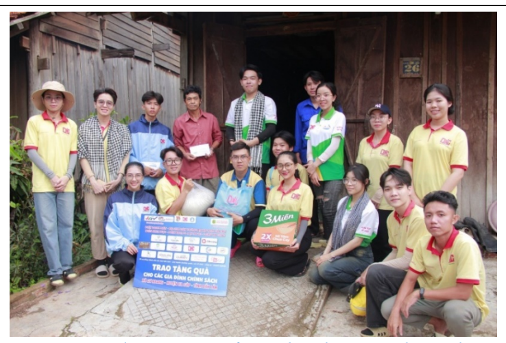
DNC students gave gifts to disadvantaged people