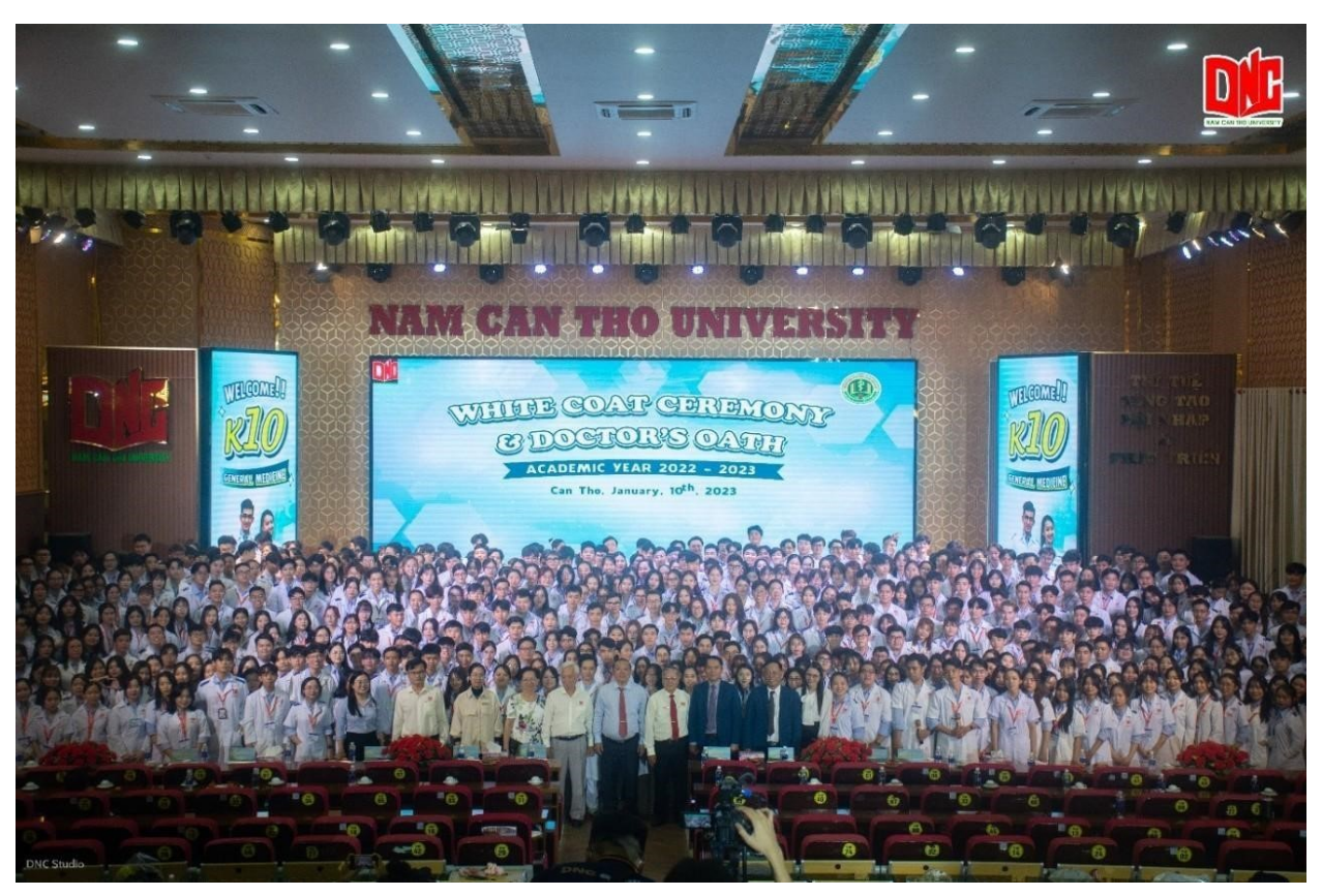
Training medical human resource is the mission of Nam Can Tho University

The DNC Medical Club at Nam Can Tho University is dedicated to promoting international medical integration for its students. In 2023, the club organized the second season of its "International Medical Integration" program, building upon the success of the first season's "DNC Medical Students Luggage" program in 2022. This program has garnered attention not only from DNC's medical students, but also from students at other universities with medical training throughout the country.