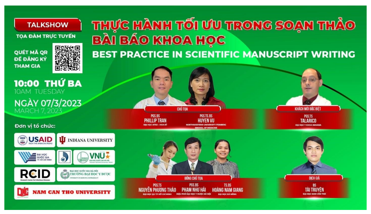
Seminar on "Optimal Practices in Writing Scientific Articles" with the participation of prominent experts

The program serves as a platform for fostering exchanges, connections, and support among medical students from Nam Can Tho University, Hanoi National University, Danang University, Ho Chi Minh City National University, and American Medical University.