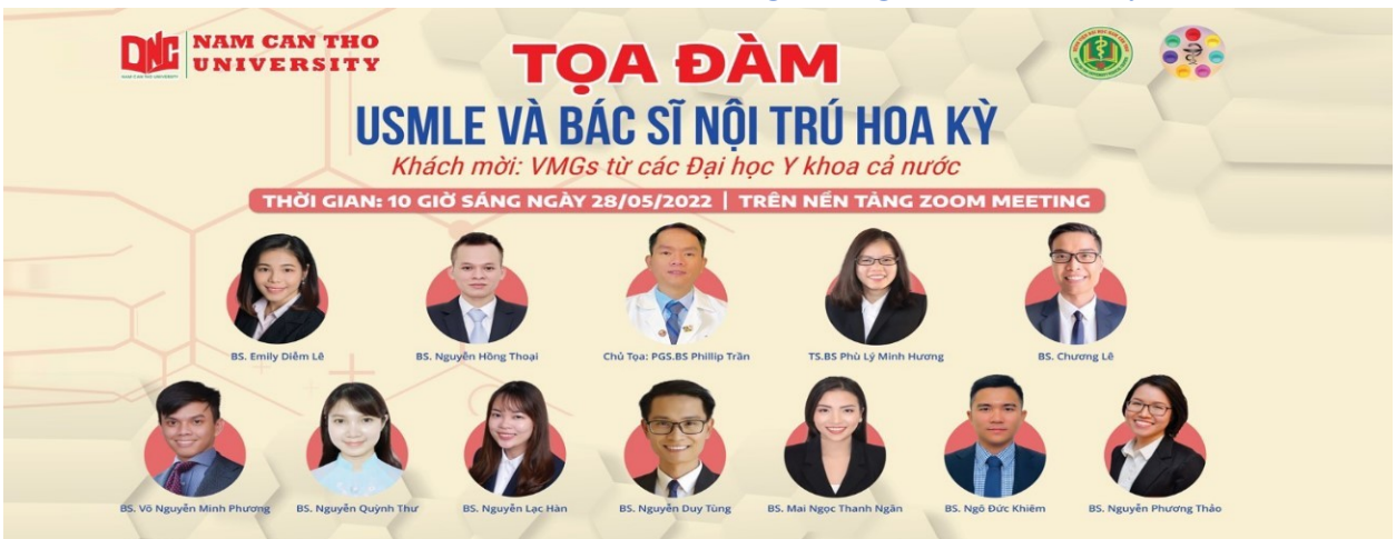
The seminar "USMLE and US Residency" helps students better understand the study methods and become a Resident Doctor in the United States International Medical Integration is a program that aims to teach and exchange knowledge and medical research methods through a digital platform. It combines Vietnamese lectures with specialized English to enhance and

The DNC Medical Club at Nam Can Tho University is dedicated to promoting international medical integration for its students. In 2023, the club organized the second season of its "International Medical Integration" program, building upon the success of the first season's "DNC Medical Students Luggage" program in 2022. This program has garnered attention not only from DNC's medical students, but also from students at other universities with medical training throughout the country.